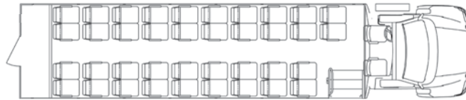
39 Passenger w/ Luggage